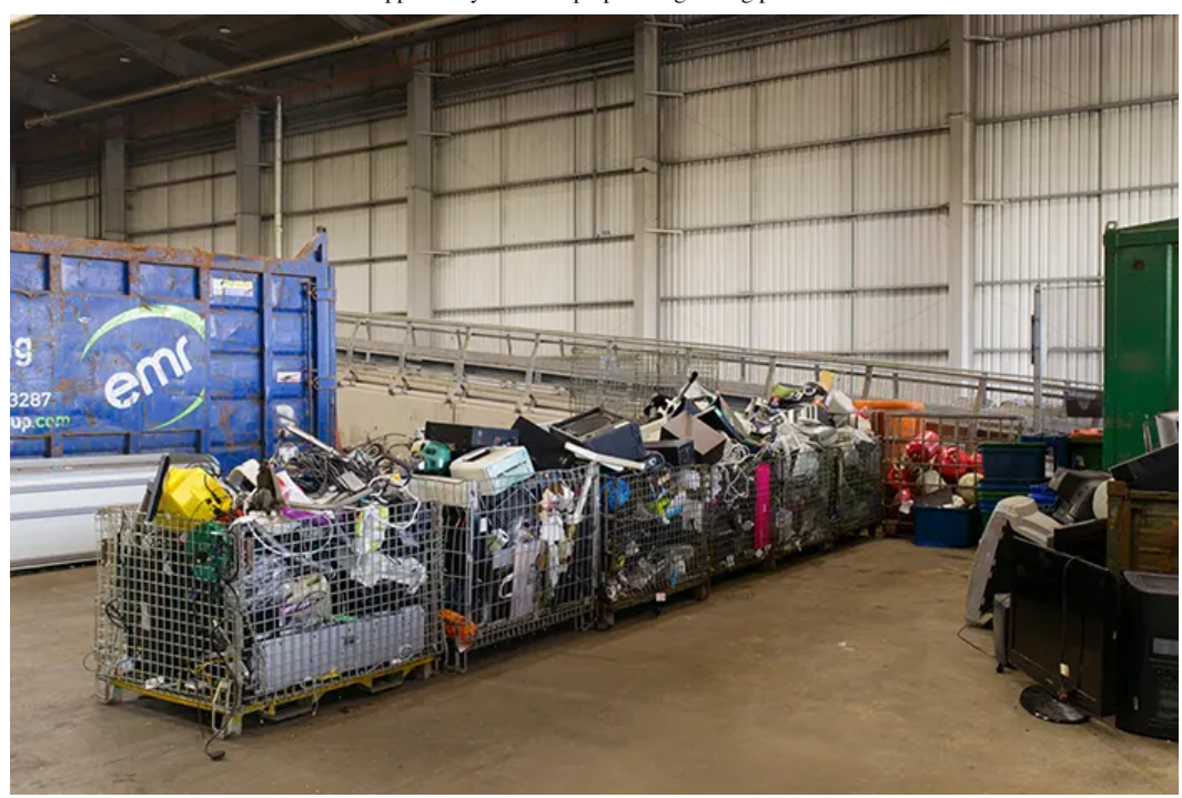
The Veolia recycling facility in Southwark, London, is one of the biggest facilities in the UK

E-waste is the fastest-growing element of the world's domestic waste stream, according to a 2017 report by the <u>UN's Global E-waste Monitor</u>. Some 50m metric tonnes will be produced annually this year — about 7kg for every person in the world. Just 20 per cent will be collected and recycled.