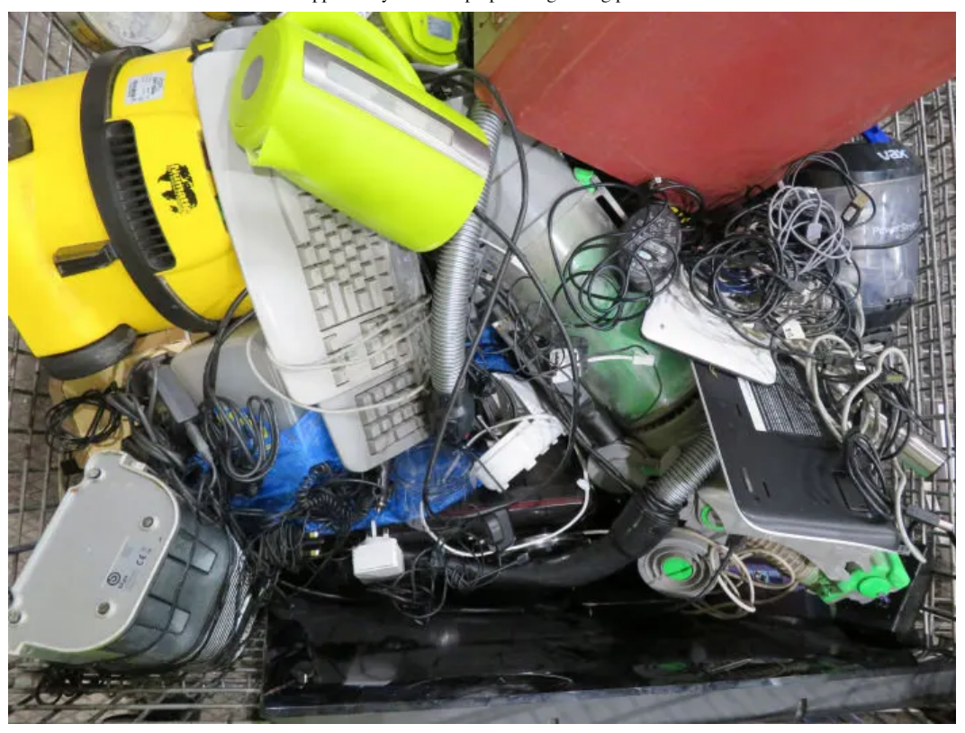
Most e-waste at the Veolia Southwark facility will need to be sent elsewhere for more specialised treatment; in the end it all needs to be reduced to core metals. It's a bit like a mining activity,' says Kirkman

"There are lots of different types of plastic in a coffee maker," says Kirkman, which can complicate the process. In the end, all e-waste needs to be reduced to core metals. "It's a bit like a mining activity," he says.